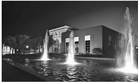
Whittier Law School

New Courtroom brings law community to campus. In 2013, Whittier Law School opened the Kiesel Advocacy Center, a state-of-the-art courtroom located on campus. The 4,400-square-foot courtroom provides a sophisticated environment for students to practice for mock trial and appellate competitions. The spectacular space has also