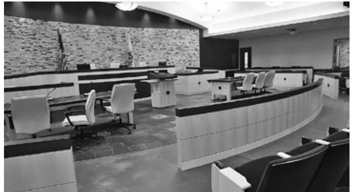
Opened last year, the new Kiesel Advocacy Center at Whittier Law School is a state-of-the-art courtroom which draws the legal community to our campus for practice trials and ADR. It includes a jury room which is wired for sound to hear jurors' discussions, and a judge's chambers.