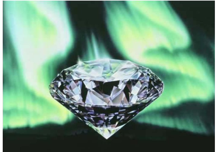
A cut diamond, polished and ready for sale.

Maggi, Michael. "The Currency of Terrorism: An Alternative Way to Combat Terrorism and End the Trade of Conflict Diamonds." Pace International Law Review , Vol. 15, No. 2 (Fall 2003):513-45. (JX1 .P31)