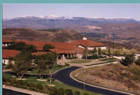
Ronald W. Reagan Library and Museum, Simi Valley, California