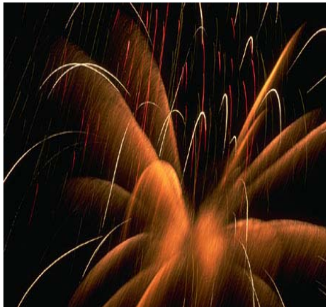
Large pyrotechnic displays thrill crowds, but illegal fireworks cause the most injuries to persons and damage to property.

Internet sales of "safe and sane" products to California residents violate Section 12560 of the California Health and Safety Code. Title 49, Part 173, Subpart C of the Code of Federal Regulations describes how all fireworks are to be packaged and transported. Moreover, it is ille-